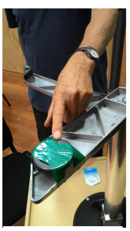
Steady as a Rock!!