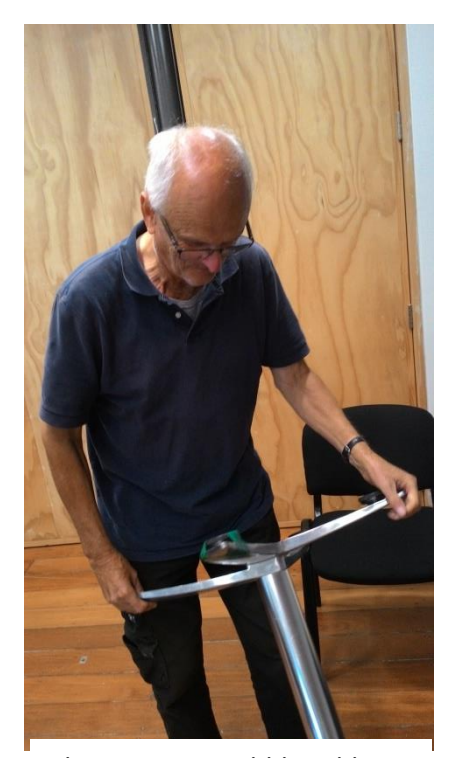
This is a <u>very</u> Wobbly Table – I'll just get my tools......

The story of a VERY Wobbly table that is wobbly NO MORE - Thanks Ed – you are a Legend!